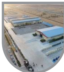
3. Parand Factory