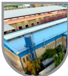
2. Vilashahr Factory