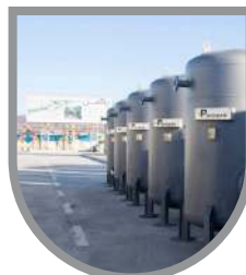
4. Parand (2) Factory