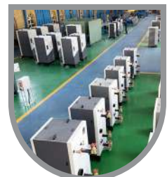
5. Bonyad Factory