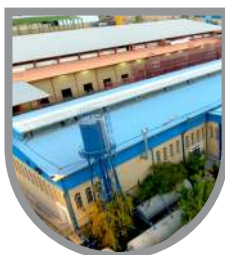
2. Vilashahr Factory