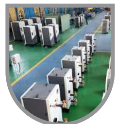
5. Bonyad Factory