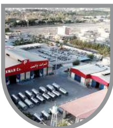
1. Isfahan Factory