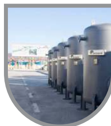
4. Parand (2) Factory