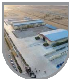
3. Parand Factory